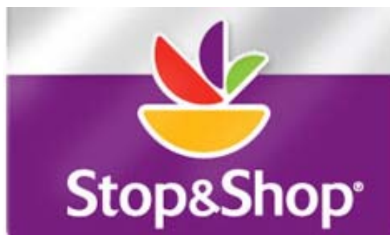
4% to Maimo PTA