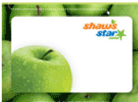
4% to Maimo PTA

A Percentage Of Your Purchase Will Automatically Benefit Your Maimonides Student!!!