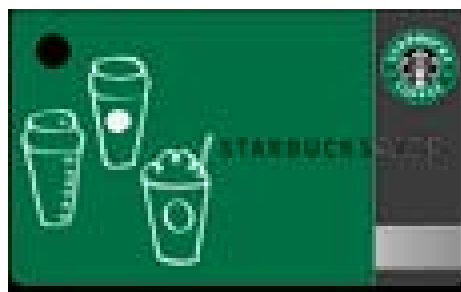
7% to Maimo PTA